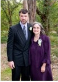
Name: M&M's Mission Moments Swinertons with CCCA